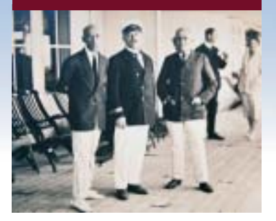
Santos-Dumont and Gago Coutinho (the last on right) in the 1920s